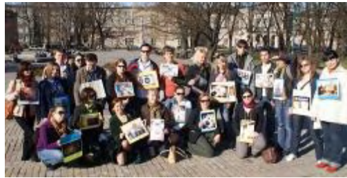
During the „Moving exhibition“ in Lublin

and political topics by means of numerous integration workshops, language animation, debates and simulation workshops. Each of national groups will also presented their traditions and local customs and showed a movie produced in their country.