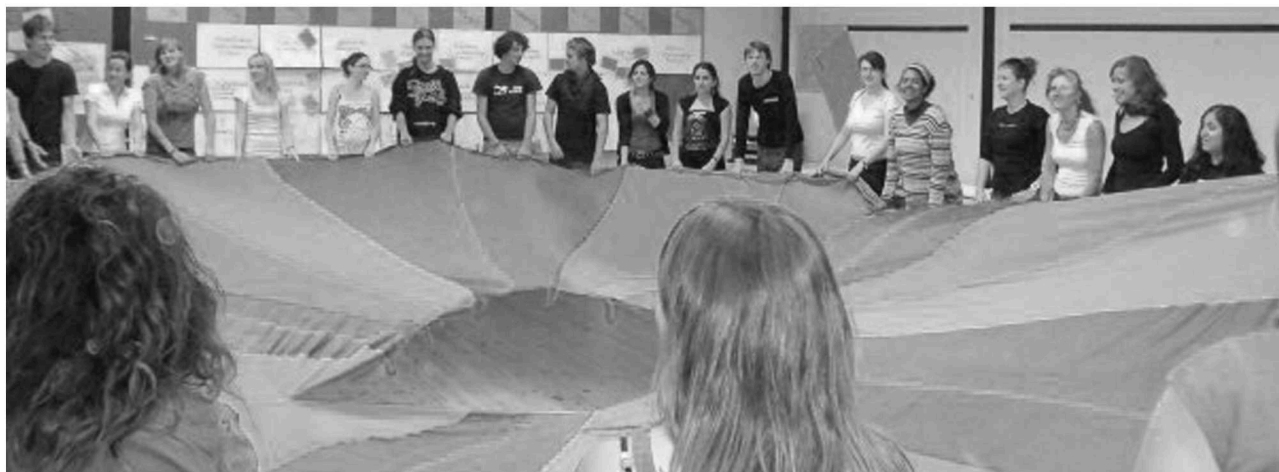
European Volunteers during an EVS Training Seminar

To be between 18 and 30 years old. Reside in a EU state or associated. No need to speak the language of fate, but is valued, if not, English is used. This depends on the chosen project.