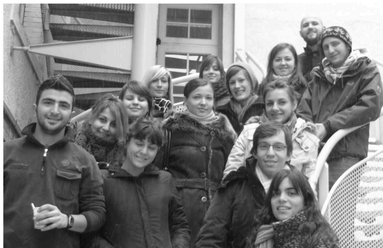
The authors of this reader Febuary 2010 in Orleans

You can view the videos on www.europeanweb.tv