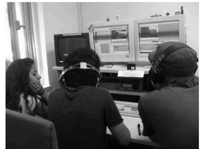
Israeli and German Youngsters while shooting and editing.